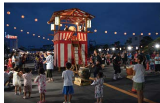
■ Summer festival (2019)

We also host site tours for the residents and accept children's visits so that they can better understand our corporate activities.