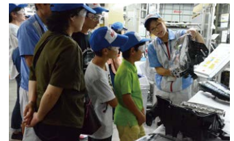
■ Children's visiting day (2019)