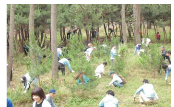
■ Weeding at Miho-no-Matsubara (2019)