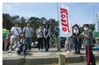
■ Clean-up activities at Miho coastline (2019)

As a member of the local community, each factory continuously engages in clean-up activities of surrounding communities to improve and protect the nearby environment.