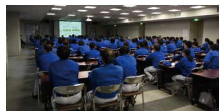
Staff QC Meeting (2019)

KOITO will continue to enrich activities on training and education to further improve quality.